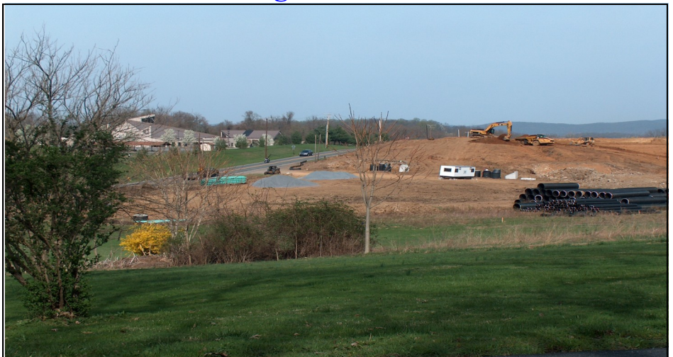
Earth moving equipment began work at the site along Rt. 562 in March. This photo was taken from Schaffer's Road looking east along Rt. 562. St. Catharine's Church can be seen in the upper left corner.