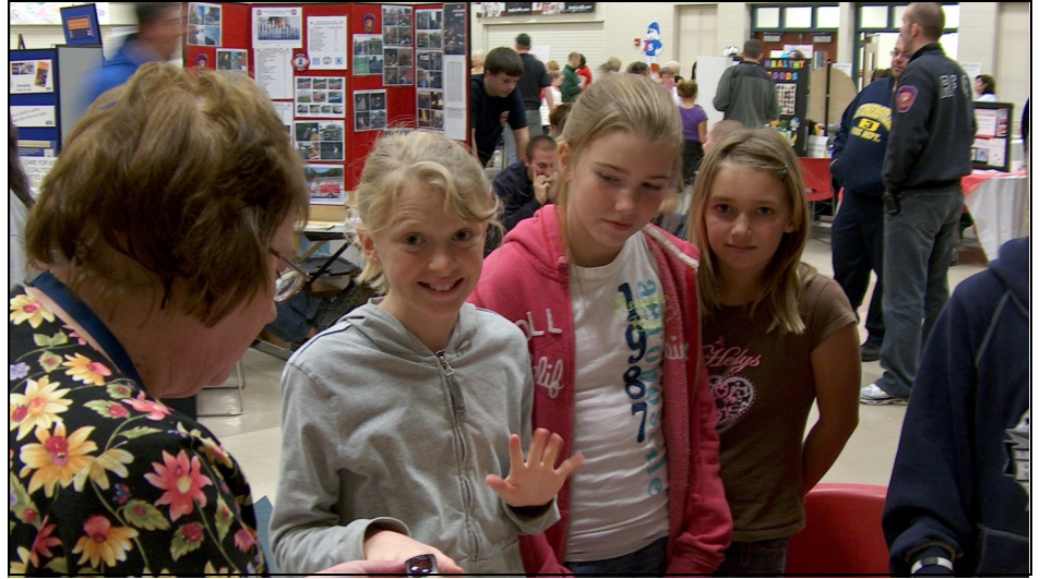
A technician from St. Joseph Medical Center checks a student using pulse oximetry at the Health Fair held this past November. Over 500 students, parents, and senior citizens attended the event which is organized

Berks County Community Foundation administers more than 100 scholarship funds for Berks County students. Most of the scholarships have very specific eligibility criteria. The complete list of scholarships administered by Berks County Community Foundation is available online at www.bccf.org . Interested students should review available scholarships online now. With a few exceptions, most applications will be accepted beginning January 15th through April 1st.