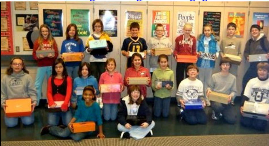
Reiffton School's Morning Reading Club promotes a love of learning and engages students in a variety of reading activities and experiences. These students hold some of the boxes filled with collected items to be sent to children in more than 100 countries. See the article on page 5.